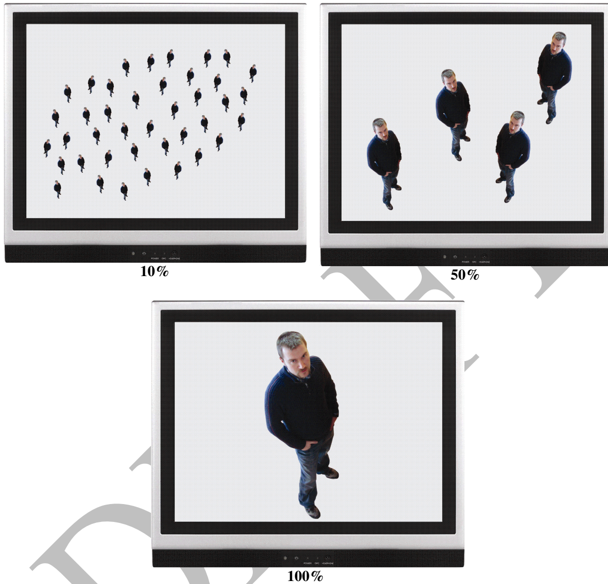
Figure 1 - Graphic Example of Clause 6.2 requirements

6.3 When designing the system, installers shall conduct a risk assessment to determine the risk level and shall also design the system paying attention to the function of the observation or surveillance as described by the client and/or user. The function of the observation or surveillance can include: